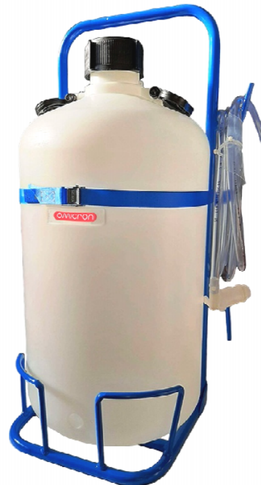
50 LITRE CONTAINER WITH TAP AND SUPPORT CODE: 2000.22S