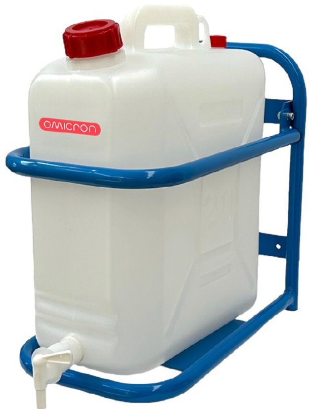
20 LITRE CONTAINER WITH TAP AND SUPPORT CODE 2000.56