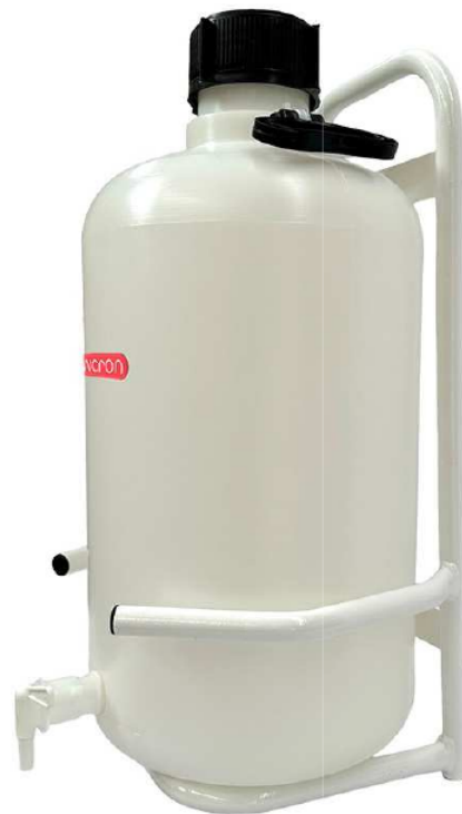
25 LITRE CONTAINER WITH TAP AND SUPPORT CODE: 4000.11