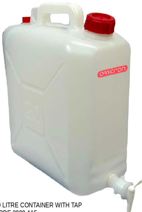
20 LITRE CONTAINER WITH TAP CODE 2000.A15