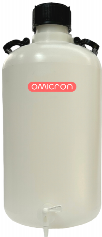
25 LITRE CONTAINER WITH TAP CODE: 4000.13