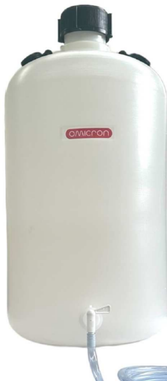
50 LITRE CONTAINER WITH TAP CODE: 2000.22